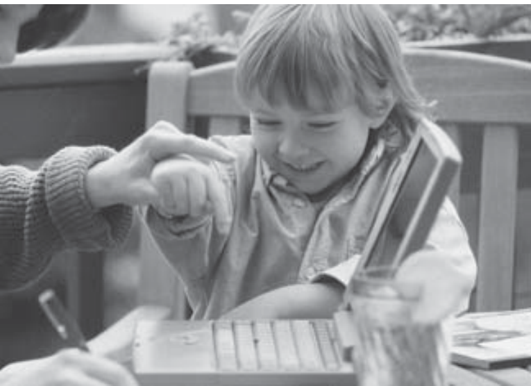
Development of Odyssey Writer, a software tool, at Compass Learning